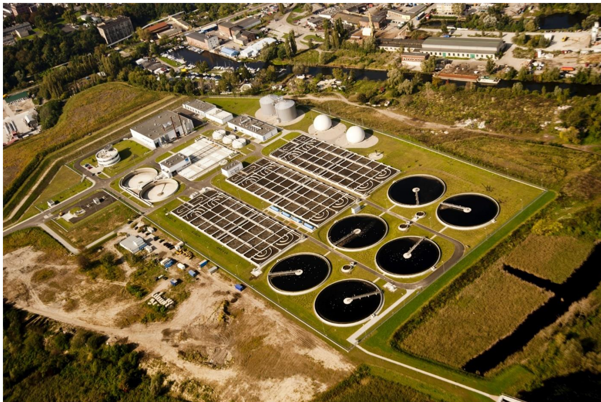
A waste water treatment plant in Poland

on the impact of urbanisation and population growth on the environment, especially on water resources. It mobilised EU Member States, regional and local governments, and sanitation services to act systematically. As a result, sanitation service providers develop and build sewerage systems and waste water treatment plants, which are the ultimate point in preventing pollutants from entering the aquatic environment. It is up to waste water treatment plant operators to remove potentially hazardous substances that cannot be controlled or blocked or avoided at their source.