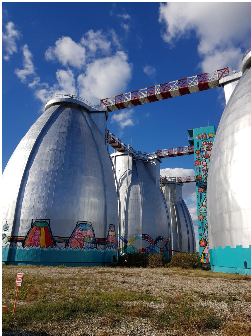
Digestors at a WWTP in Romania

Modern sanitation services have little to do with those from a century or even decades ago. They are no longer only focused on collecting and treating municipal waste water; they are an essential part of the circular economy. Nowadays, waste water treatment plants are becoming bio-factories, where electricity and heat are generated, where valuable nutrients and clean water are recovered, and fertilisers are produced. The total volume of reclaimed water produced from waste water in 2018 reached more than 11 million m 3 4 . This treated water can be reused in industrial processes, in agriculture, in the maintenance of natural areas and also for various urban uses. Some of these bio-factories are